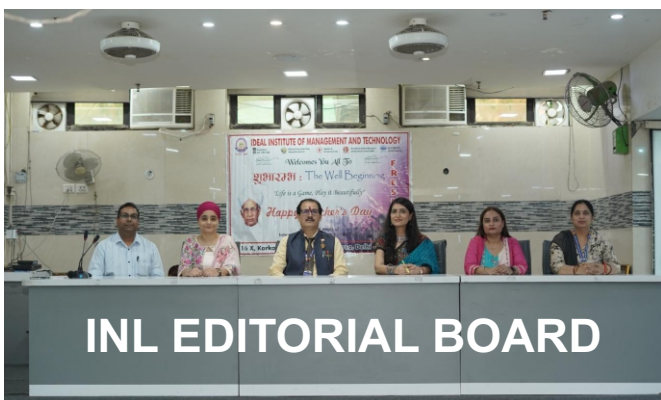
INL EDITORIAL BOARD