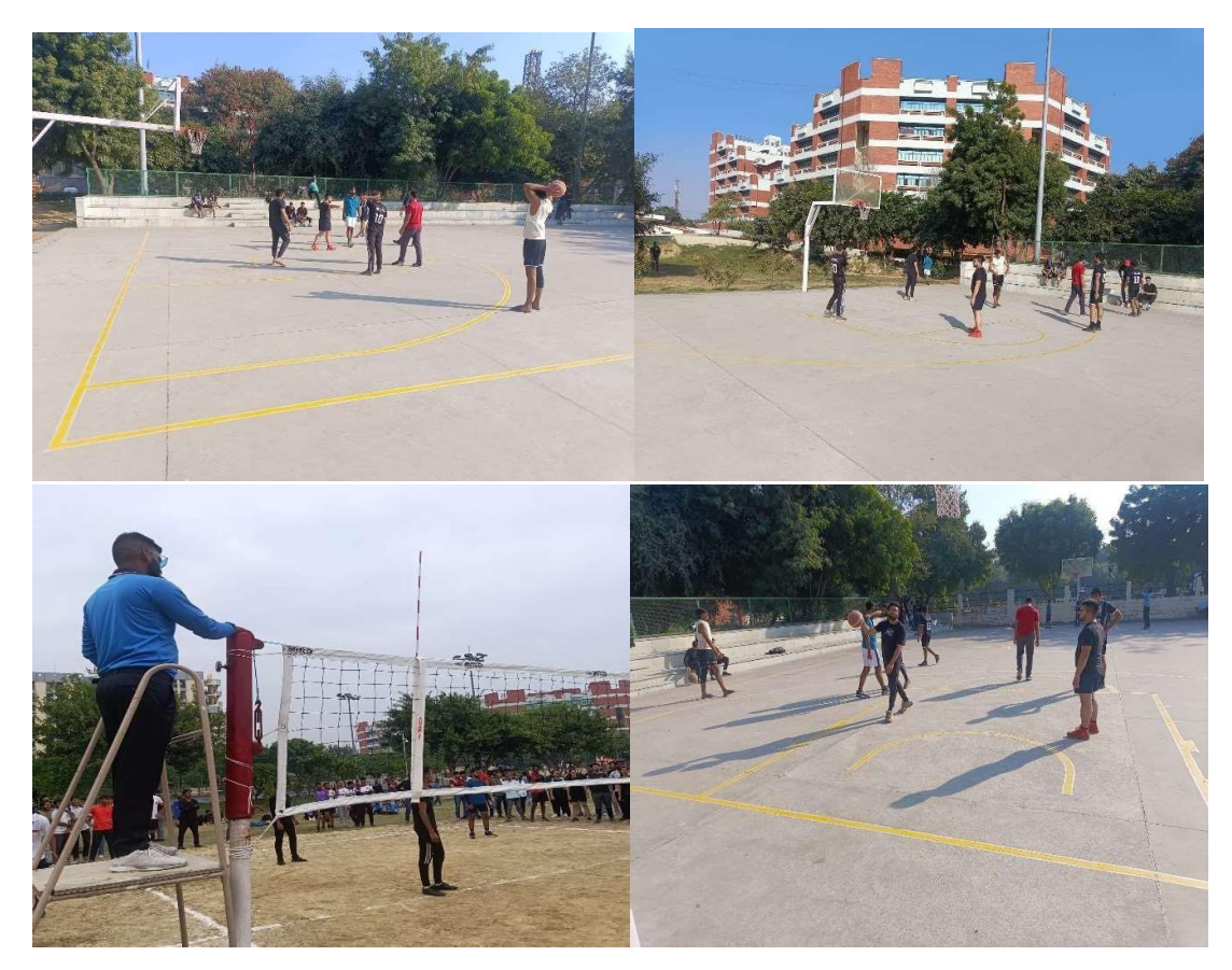
Sports Meet in Vivekanand Mahilla College